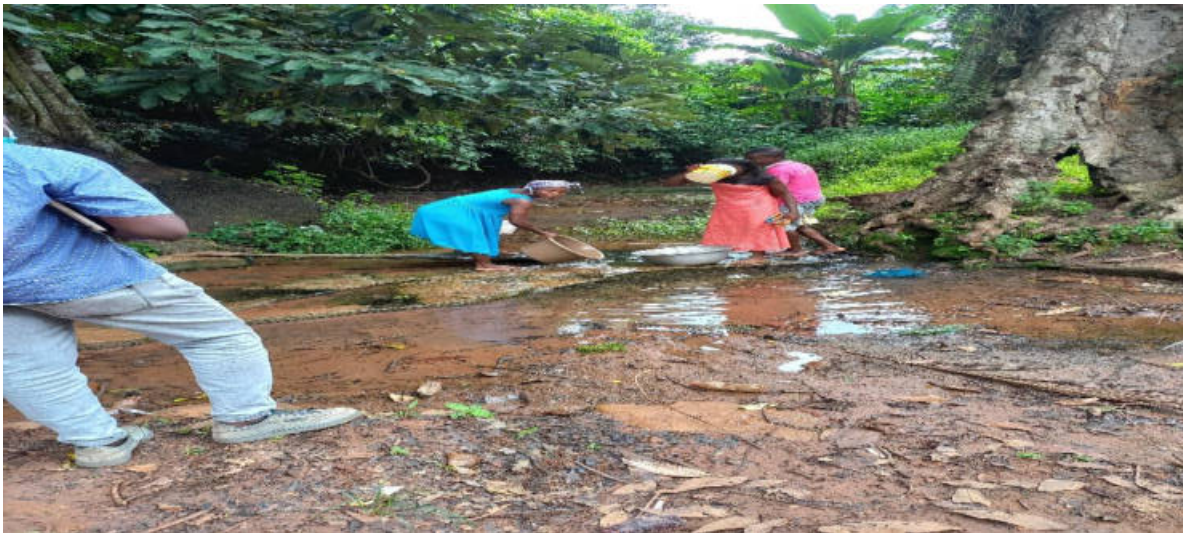
Water is life!! A community member quenching her thirst with the untreated water