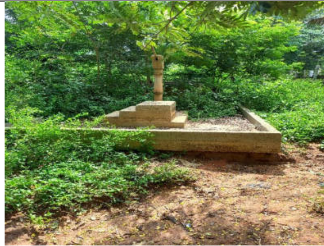
Borehole that produced water with iron and salt deposits which is broken down and abandoned about five years ago

and abandoned by the community five years ago. The water from the boreholes has iron deposits in it and salty which makes it unsafe for consumption. The other, a mechanized borehole which also is salty and thus unsafe has its pump broken down.