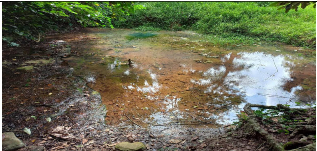
This is the OTWETIRI STREAM!! The only source of water currently at Otwetiri

Water directly affects many issues critical to promoting sustainable development, including the economy, agriculture, health, trade, energy, and peace and security. Clean, accessible water is also critical to human health and a healthy environment, yet over 40% of the global population does not have access to sufficient clean water. In Ghana, 57% of urban households have access to safely managed drinking water services compared to only 11% of rural households. Over 1.7 million Ghanaians still use unsafe drinking water sources such as streams, lakes and rivers and the Otwetiri community forms part of this category.