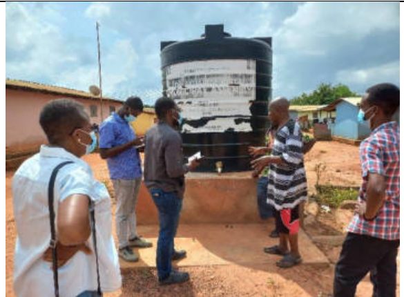
Community leader explaining the operations of the mechanized borehole to the team (salty and currently not in use because of faulty pump system)