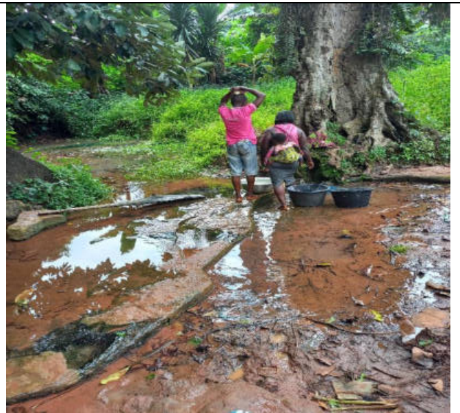
A woman and son fetching water at the stream for domestic use.