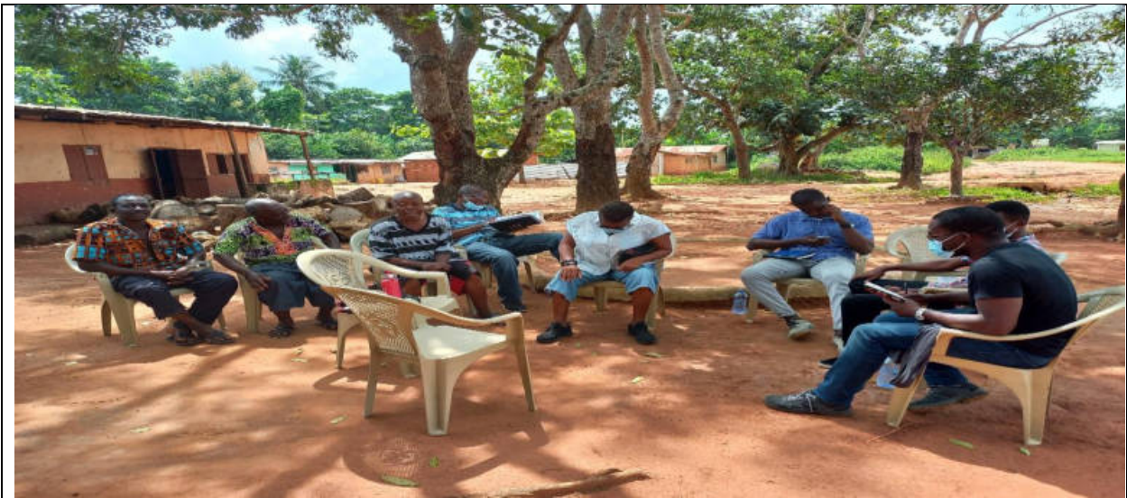
ICDP Ghana/Clean Earth/ Community leaders during a debriefing session after the inspection of the sites